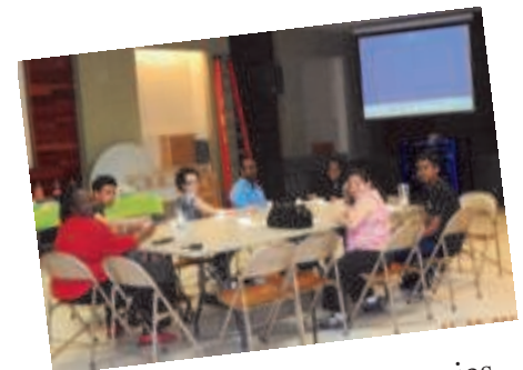
At the table with our legacies