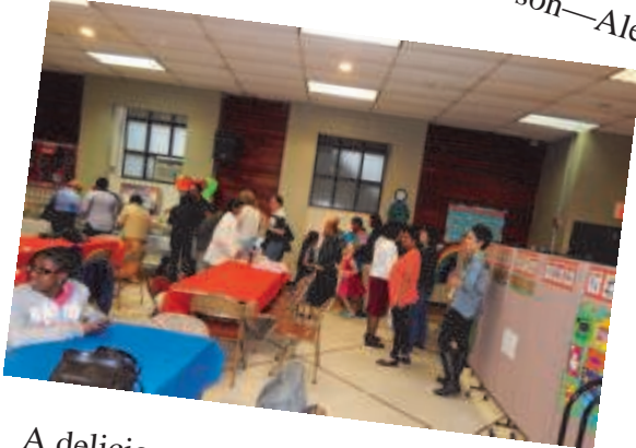
A delicious meal enjoyed by ALL.