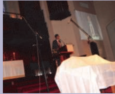
ALL are invited to The Lord's Table