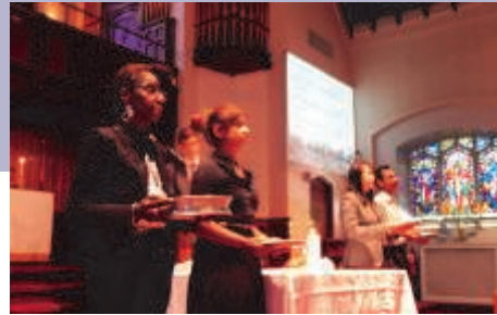
Faithful servants of God